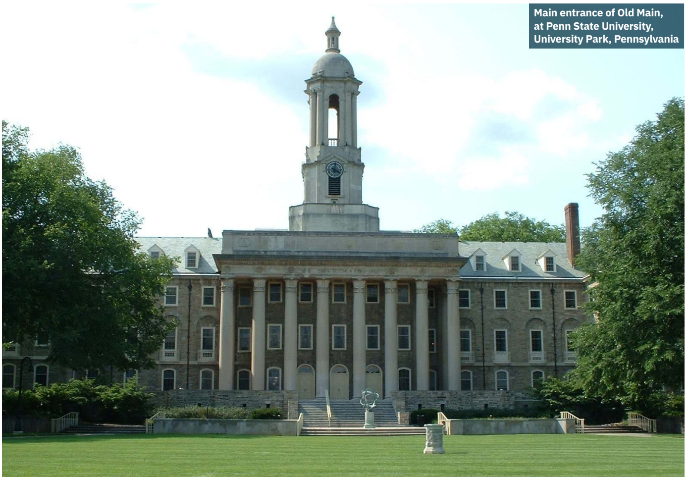
Main entrance of Old Main, at Penn State University, University Park, Pennsylvania