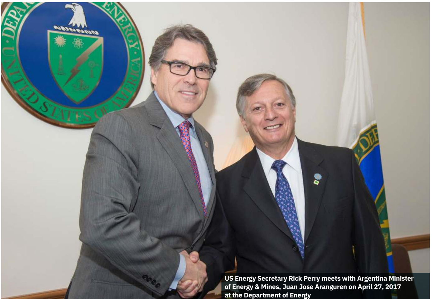
US Energy Secretary Rick Perry meets with Argentina Minister of Energy & Mines, Juan Jose Aranguren on April 27, 2017 at the Department of Energy

This briefing outlines the role played by the US government and various US public agencies in promoting fracking in Argentina, focusing primarily on the 2017-2019 period: from public finance loans worth hundreds of millions of dollars, and to offering Argentinian business and local officials recommendations on how to work with and regulate the industry.