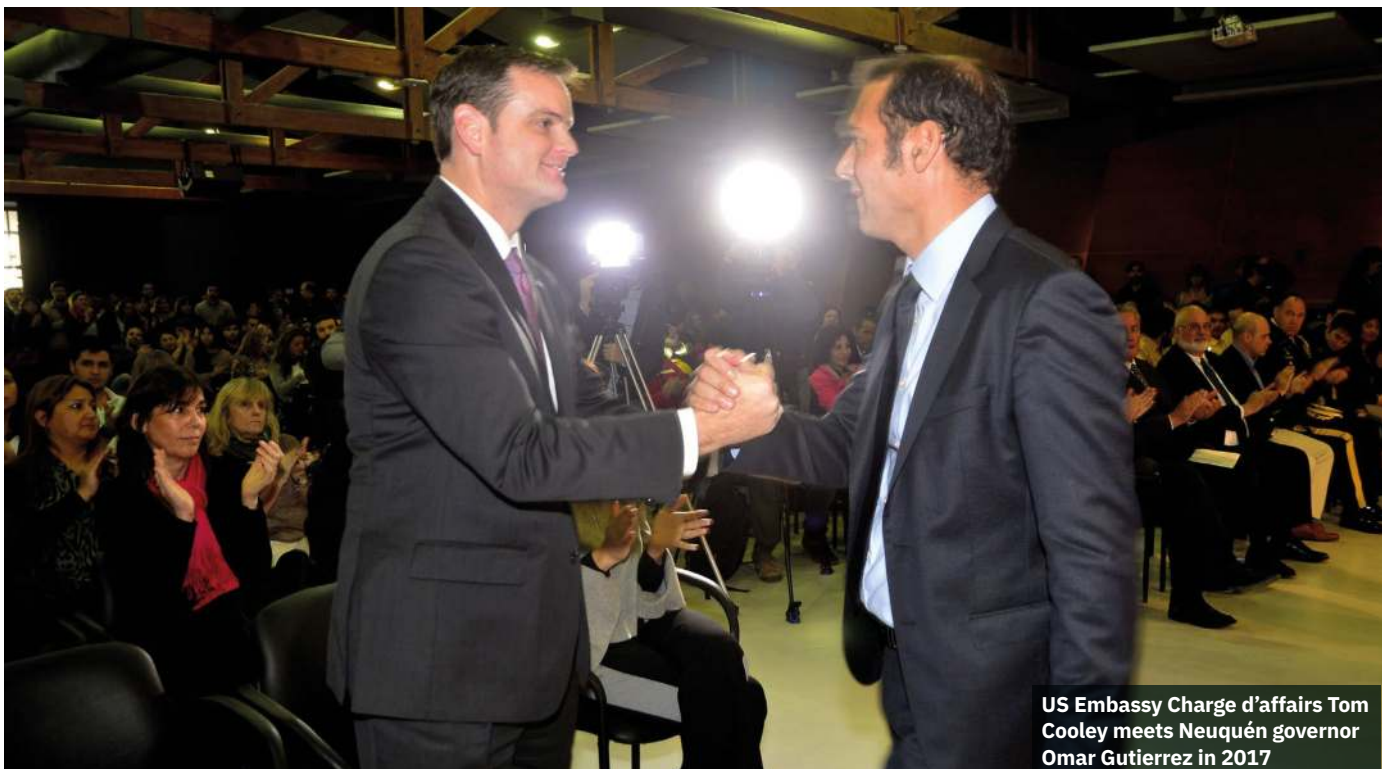
US Embassy in Argentina

These diplomatic and financial efforts together combine an obscure, unaccountable influence on Argentina's energy governance, and a push to unlock one of the world's largest remaining "carbon bombs".